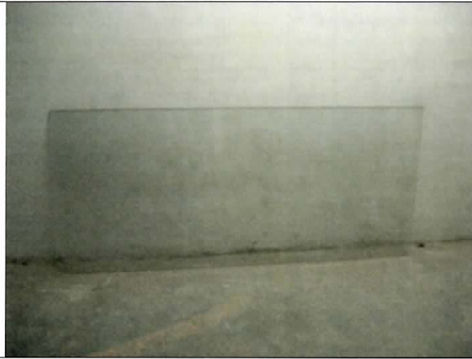
照片“A” - 樣品照片